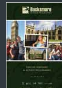
Bucksmore Summer Programmes