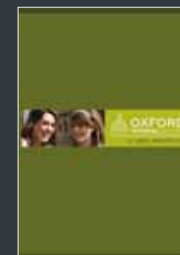
Oxford Tutorial College A-Level Programmes